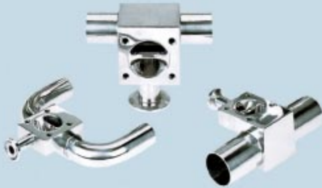
定制产品 Customized Valves