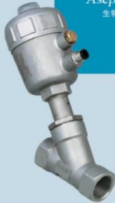
气动角座阀 Pneumatic Bevel Seat Valve