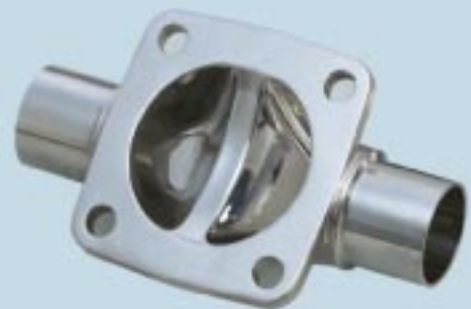
焊接式接口 Weld type Conjunction

希伯伦卫生级隔膜阀系列有ISO标准接口、DIN标准、DIN11850标准系列1、DIN11850标准系列2、DIN11850标准系列3、ASME-BPE、JIS和SMS3008标准。