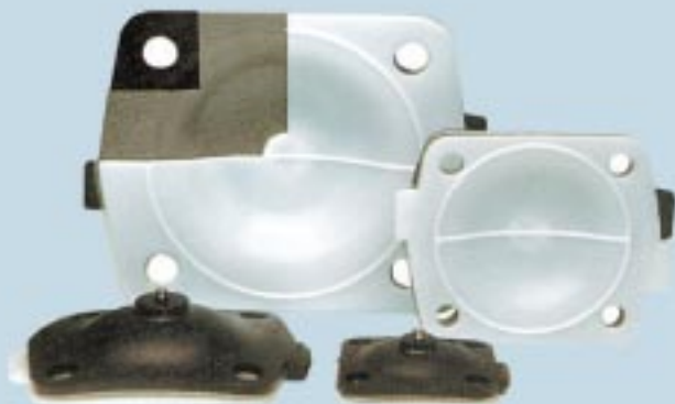
隔膜片 Xibolun Diaphragms

All Xibolun diaphragms meets FDA requirement and 21CFR177, are third party tested and certified to USP Class VI for extractables and cytotoxicity and are fully lot traceable. Full documentation is available to support industry required requirements and as an aid to system validation.