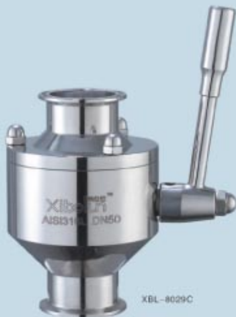
卫生级无死角球阀 Sanitary Non-residue Ball Valve