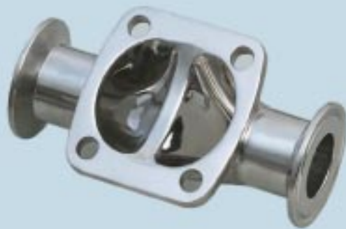
快装式接口 Quickly Set type Conjunction