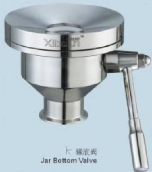
罐底阀 Jar Bottom Valve

Xibolun sanitary non-residue ball valve has the features of compact construction, facility operation and excellent leakproofness. We adopt the PTFE material in order to obtain the isolation or non-residue effect between sphere and body seat area. We improve on the sphere's technics to reduce abrasion in order to increase the life of products. Operating principle: sphere produces displacement and press out the exit-end seal to improve capability of the leakproofness, application: Bio-pharmacy, water process, fine chemical industry and beverage ect.